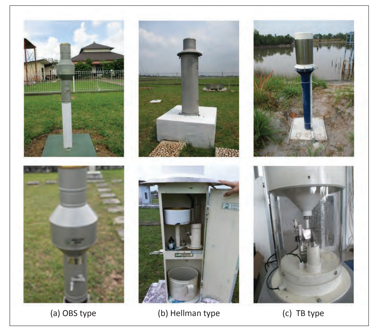
Figure 1. Three Kinds of Rainfall Sensors Installed at field

OBS is a sensor to measure rainfall manually and its result is highly dependent on the reading accuracy of operators on the measuring cup. This kind of sensor only measures the amount of cumulative rainfall within a period of time, for example 24 hours. Hence, this sensor can not measure the rainfall intensity. Measurements are performed once a day, every 00:00 UTC or 07:00 AM. The amount of rainfall is obtained from equation (1).